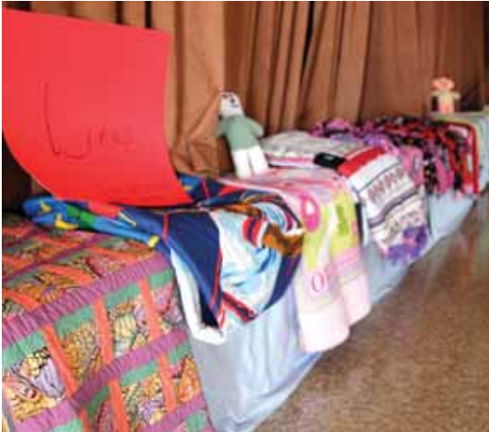
Desert Crest "Stitchery Happy Hookers"